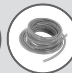
HOSES & ROPES