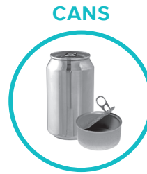
Empty and Rinse.