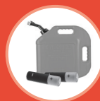
HOUSEHOLD HAZARDOUS WASTE