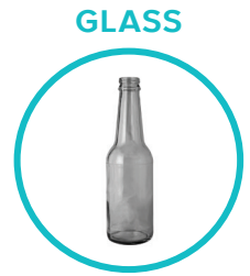
Empty and Rinse.