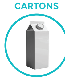
Empty and Rinse. Replace Cap.