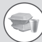
STYROFOAM™ & TAKE-OUT CONTAINERS

Not everything can be recycled. Place these items in the trash.