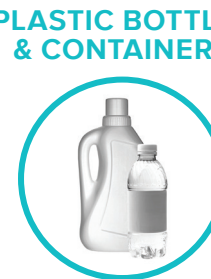
Empty and Rinse. Replace Cap.

Place these items loose – not bagged – in your recycling container.