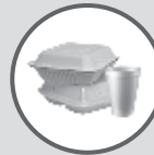
STYROFOAM™ & TAKE-OUT CONTAINERS

Not everything can be recycled. Place these items in the trash.