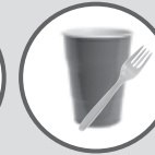
CUPS, LIDS & UTENSILS