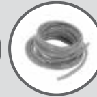
HOSES & ROPES